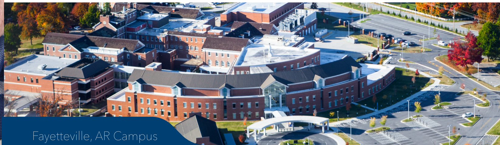
Fayetteville, AR Campus