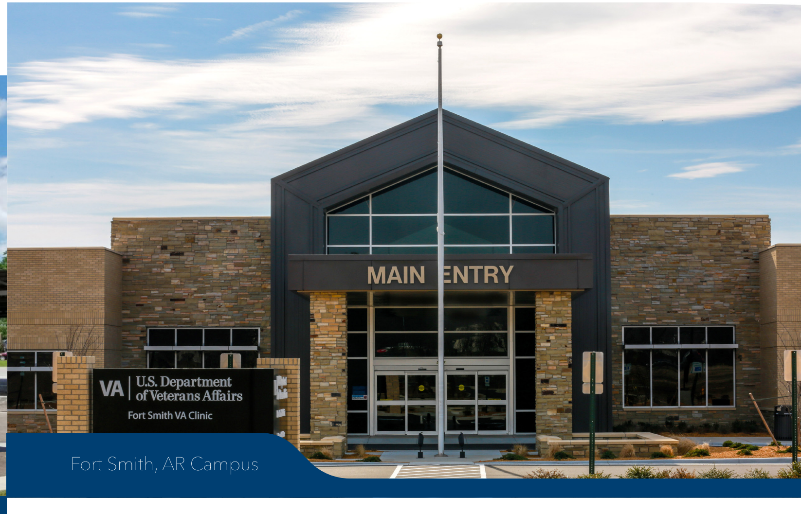
Fort Smith, AR Campus

The General Mental Health Clinics in the Southern Community-Based Outreach Clinics (CBOCs) provide a wide range of face-to face or telehealth services for eligible Veterans. Services include psychotherapy and medication management with licensed independent providers for a broad range of mental health issues including mood disorders, adjustment issues, and relationship concerns. Additionally, the Fort Smith clinic has Substance Abuse and peer-support services onsite. For more information or to request services, contact the nearest clinic in your area or speak to your primary care team regarding referrals to General Mental Health.