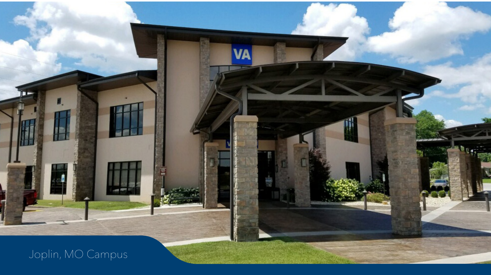
Joplin, MO Campus

The General Mental Health Clinics in the Northern Community-Based Outreach Clinics (CBOCs) provide a variety of mental health services. Services include psychotherapy and medication management with licensed independent providers for a broad range of mental health issues including mood disorders, adjustment issues, and relationship concerns. Our clinicians specialize in evidence-based therapy such as Acceptance and Commitment Therapy for Depression (ACT-D), Cognitive Behavioral Therapy (CBT), Cognitive Behavioral Therapy for Depression (CBT-D), Cognitive Behavioral Therapy for Insomnia (CBT-I), Cognitive Processing Therapy (CPT), Anger Management Groups, Effective Living Skills, and Lessons Learned PTSD Recovery. In addition, outpatient clinics have Substance Abuse and Peer Support services onsite. Contact the nearest clinic in your area for more information about services.